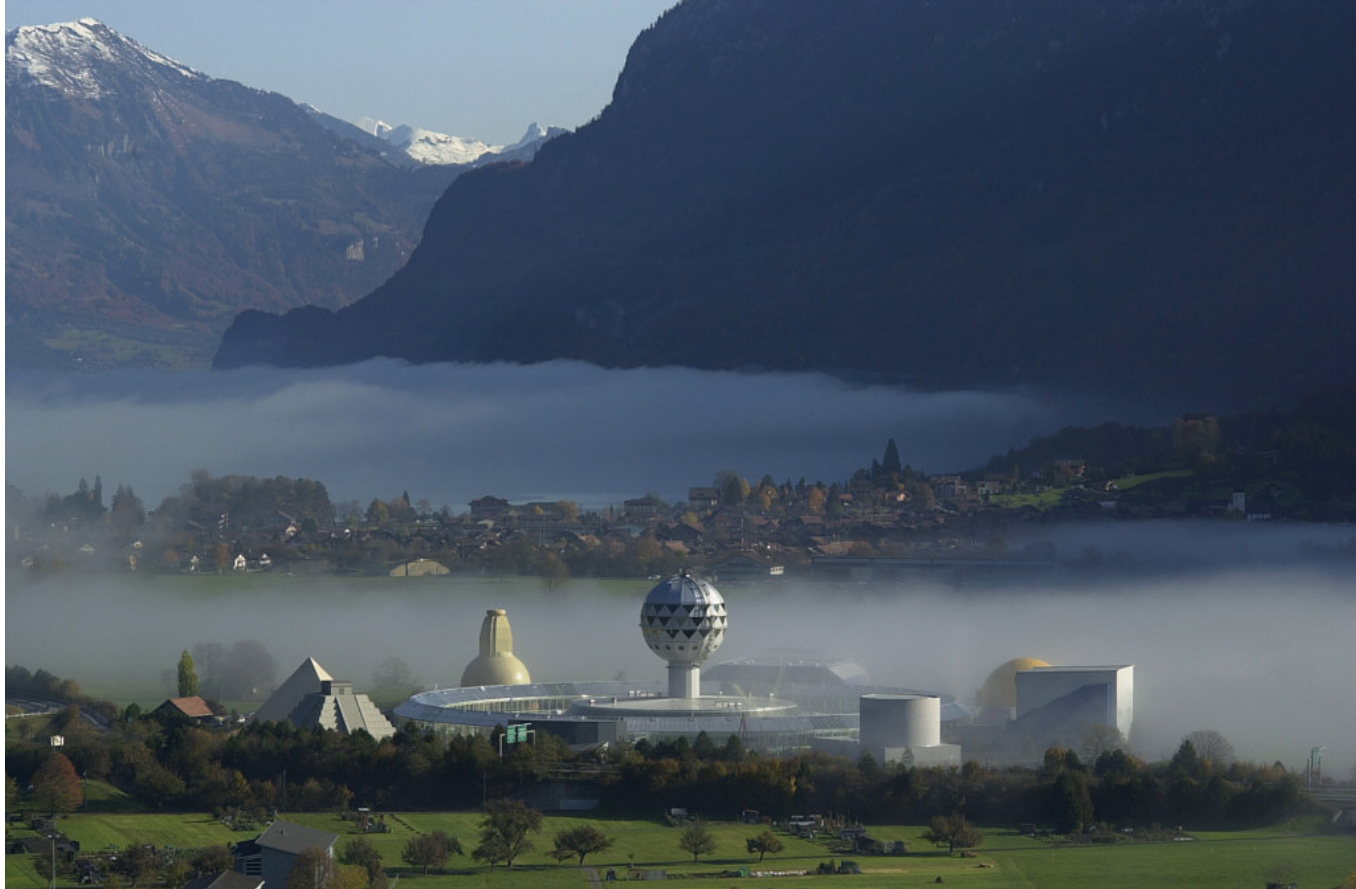
Possible location in Interlaken, Switzerland ... (in the Infrastructure of the bankrupt Mysterypark)