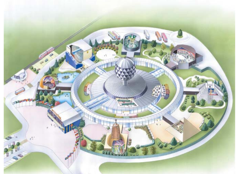
Dharma Ethic Party Economy Academy with the study houses of spiritual wisdom and cultures

- Core of the Academy: This is the actual Academy , the training center of the corruption-free, ethically educated. Here are auditoriums, libraries, accommodations and an expo center in which the secondary principles of a Humanistic Economy and the qualities and duties of corruption free, ethically educated are taught (see definition on our ethics www.ethikparty.org ).